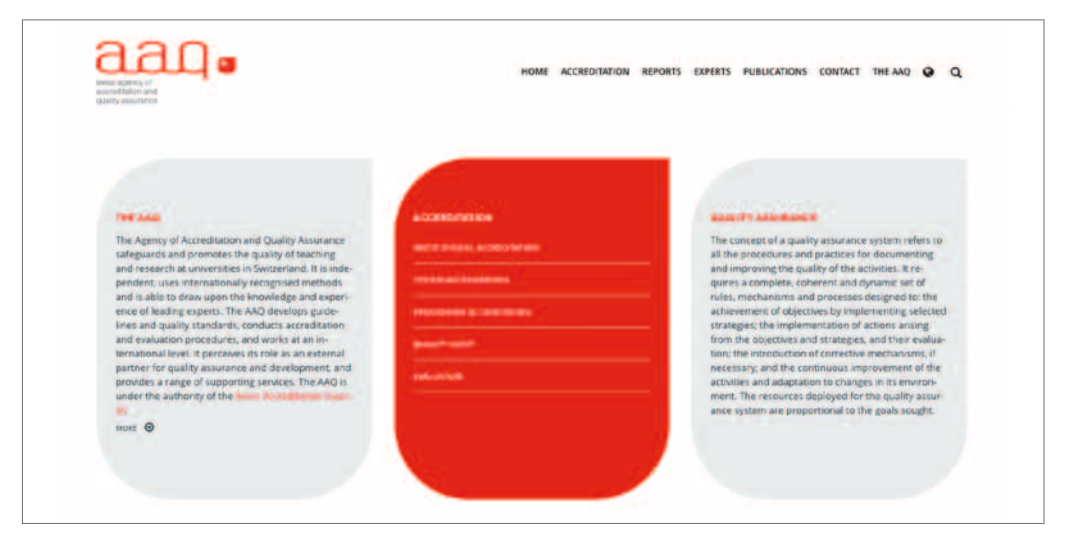
Figure 3: AAQ homepage

AAQ presents its activities on its website according to formats (methodologies), whereby a distinction is made first between the levels of institution and programme, and then according to legal frameworks (Figure 3).