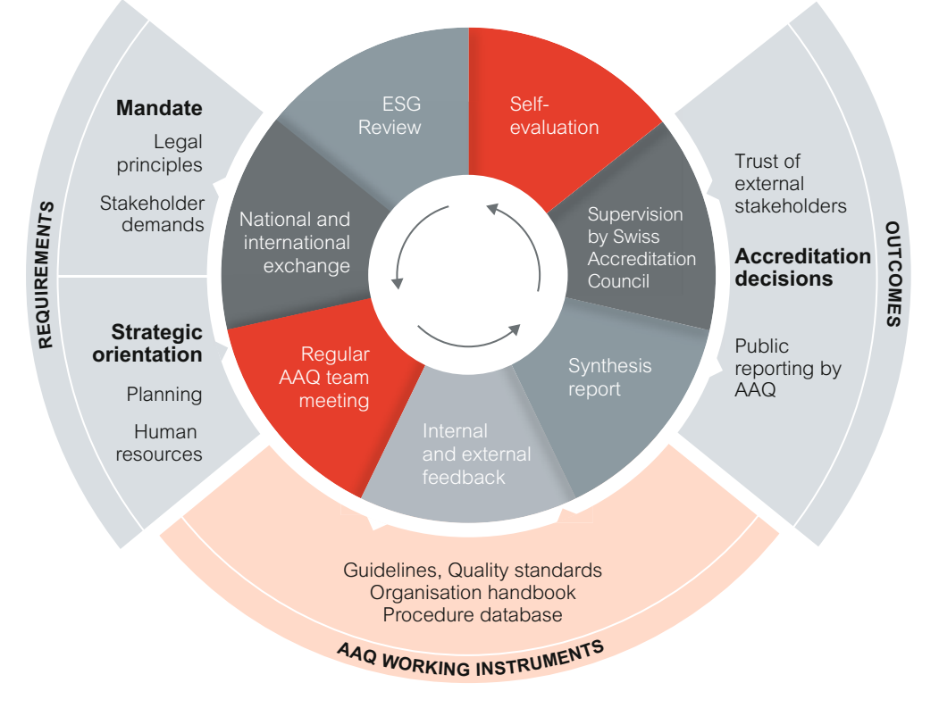
Figure 4: AAQ internal quality assurance system

AAQ's internal quality assurance system is illustrated below: