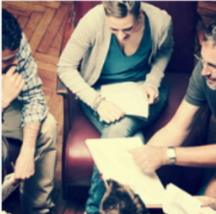
Course & curriculum