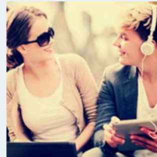
Open & flexible education